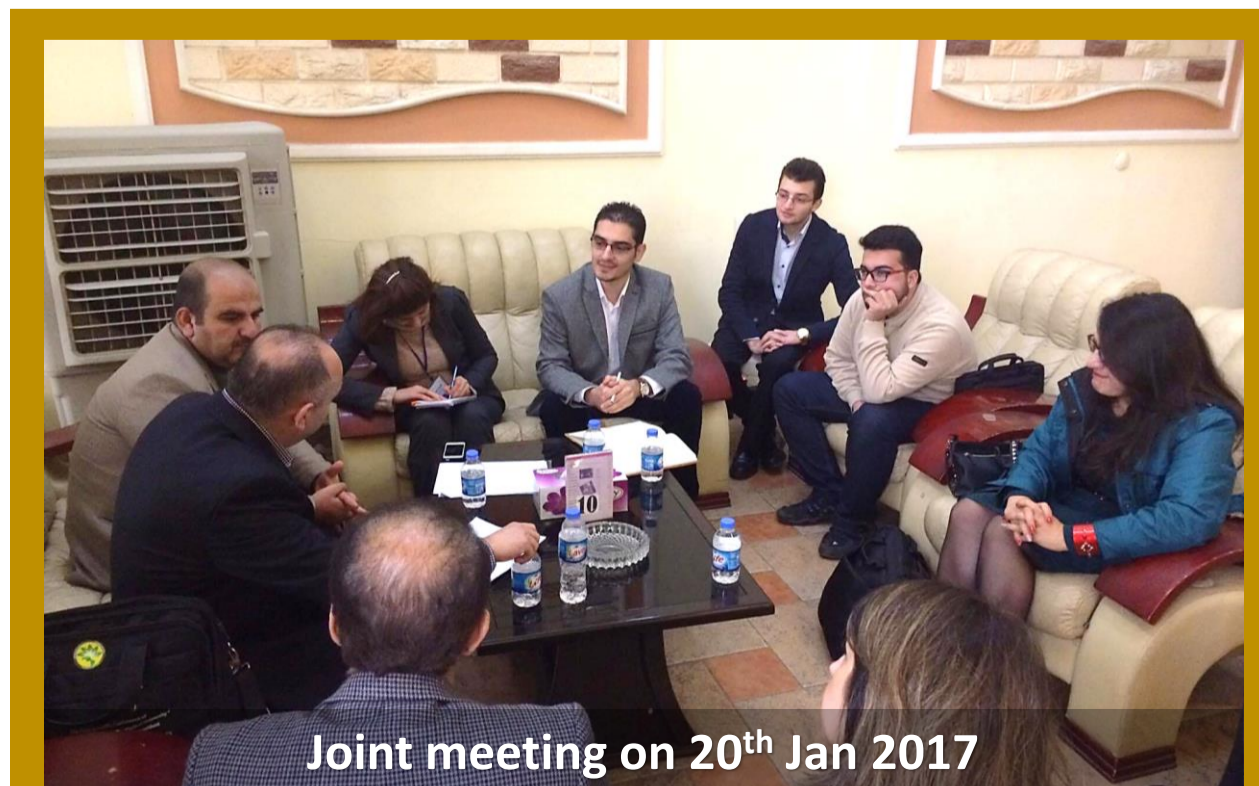
Joint meeting on 20 th Jan 2017

The attendants discussed the environmental issues or problems environment faces in Kurdistan. They also talked about the passive role the government plays especially in such a sophisticated and terrible economic condition that Iraq and Kurdistan is facing. The attendants emphasized the importance of working of the NGOs together to force the government and the policy makers through working on raising awareness of the individuals in the community as well as the role of media in such regards.