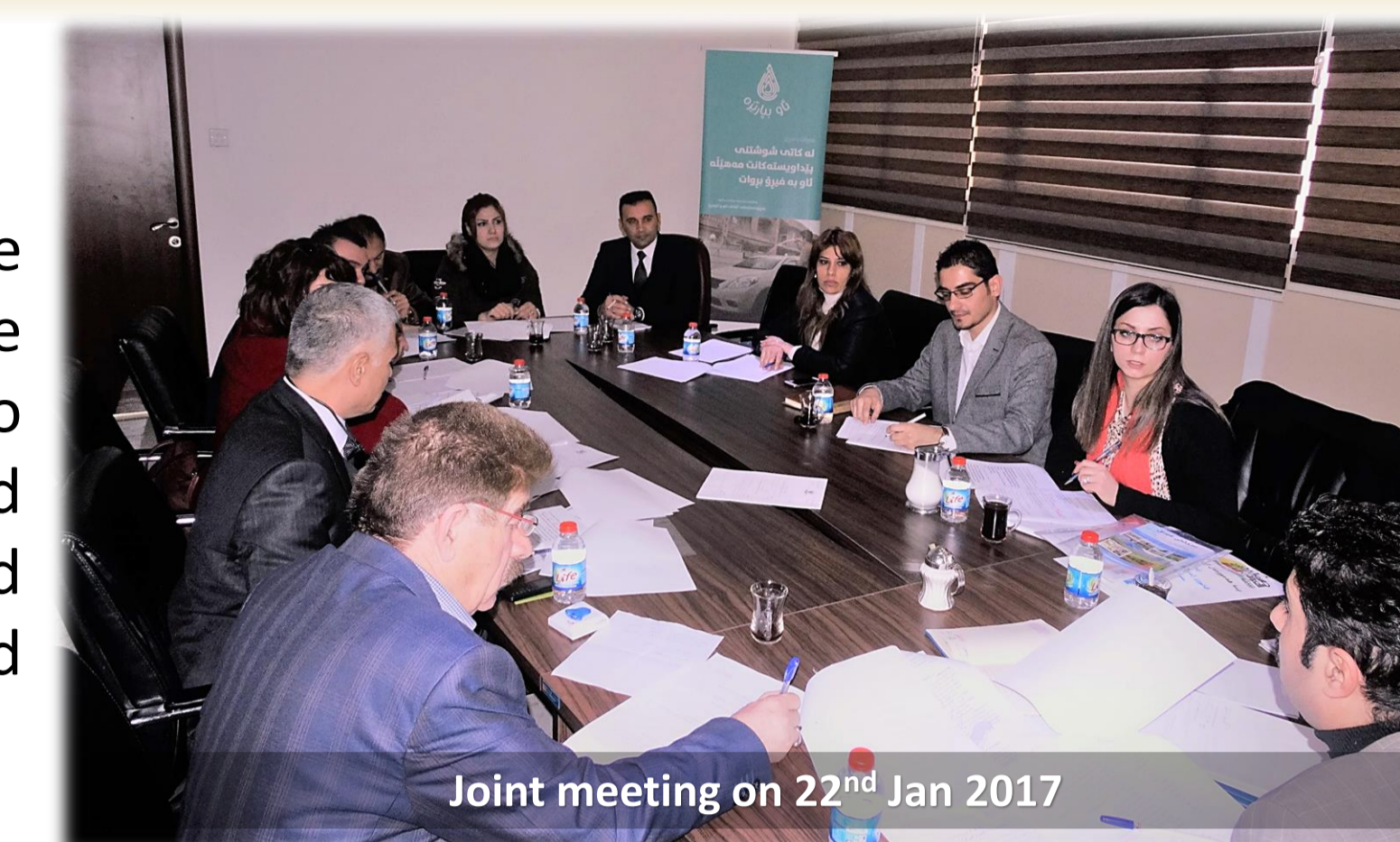
Joint meeting on 22 nd Jan 2017