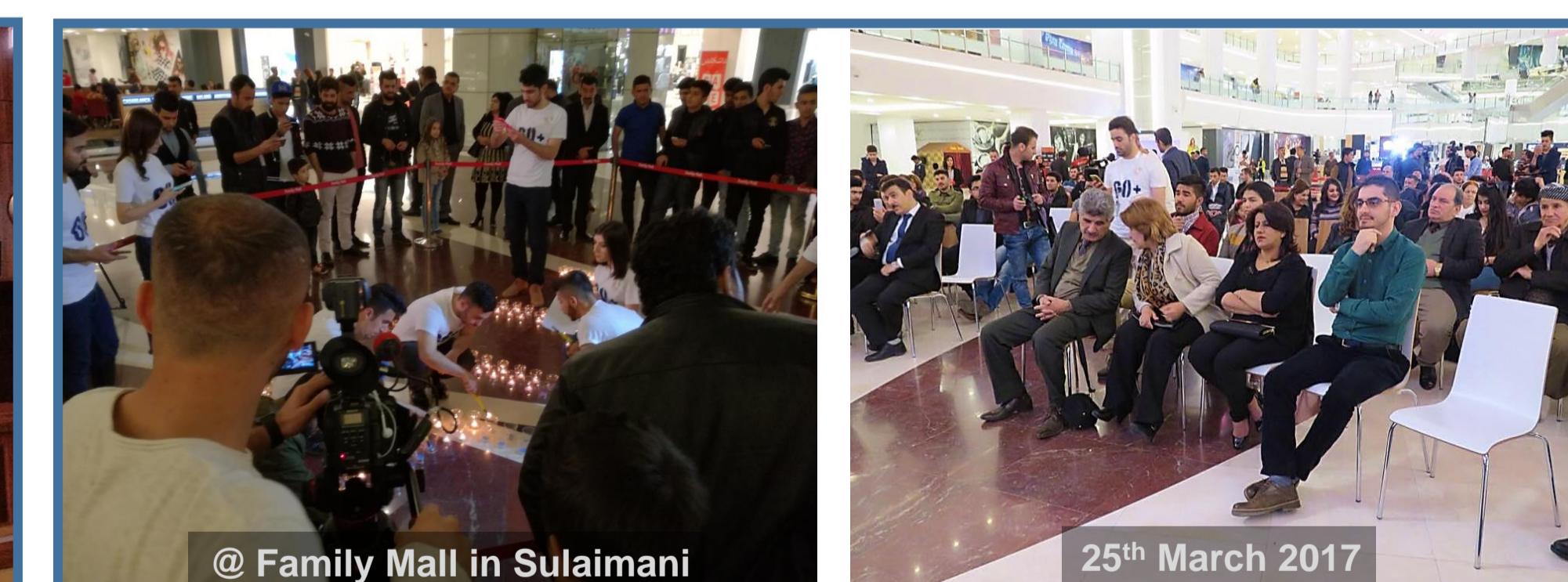
@ Family Mall in Sulaimani