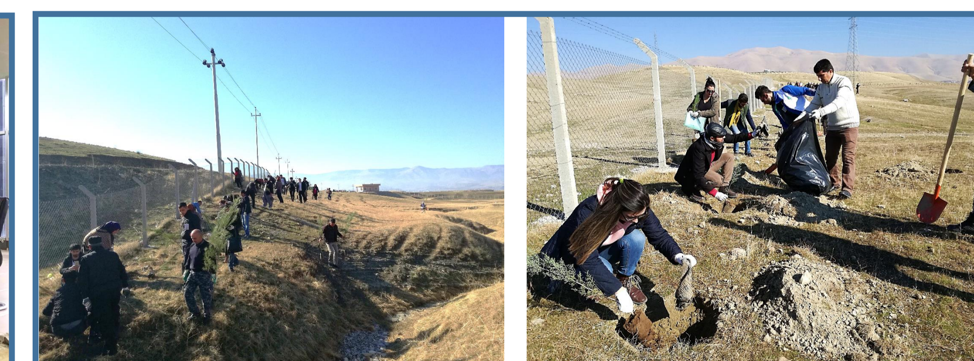
Participated in the Planting Trees Campaign in Razyana Park. Supervised by Zaitun Org & Sulaimani Directorate of Environment on 11 th Jan 2017

For more news about the Project, visit: www.natureiraq.org > Projects > WaterKeeper Law and Advocacy Program