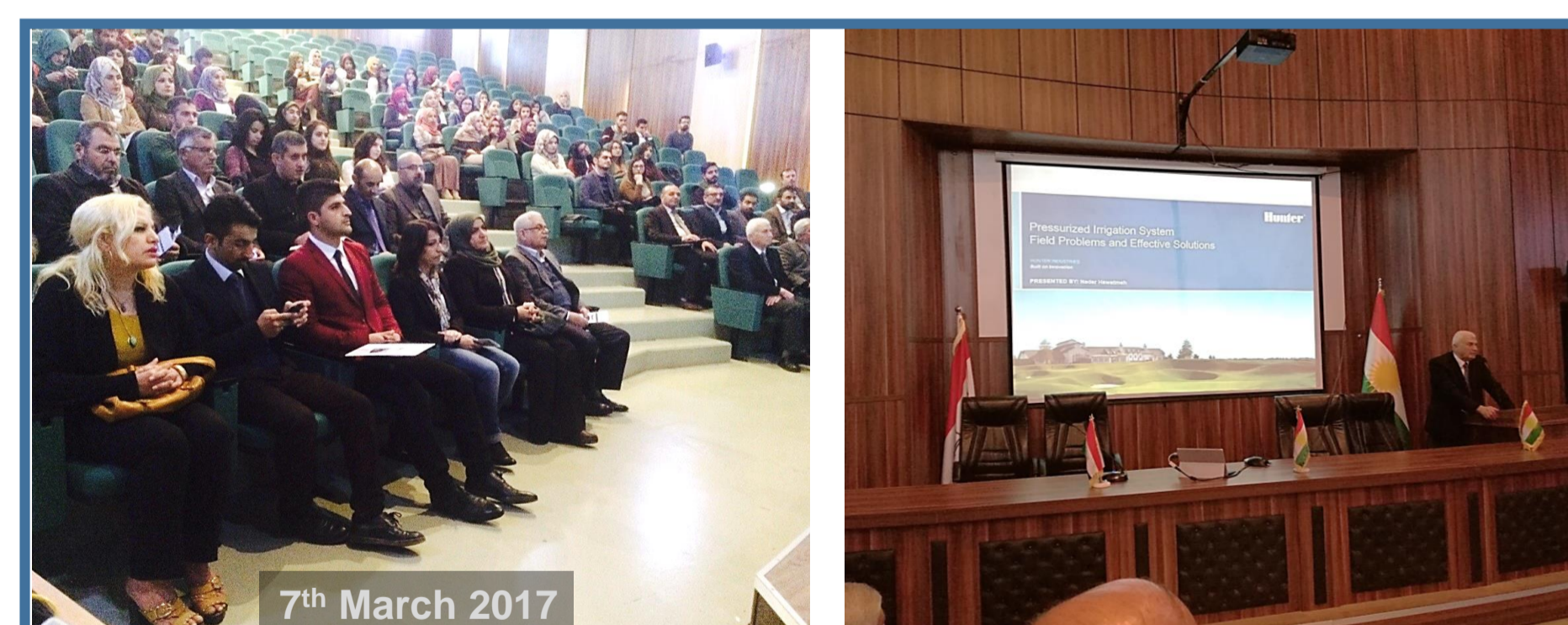
7 th March 2017